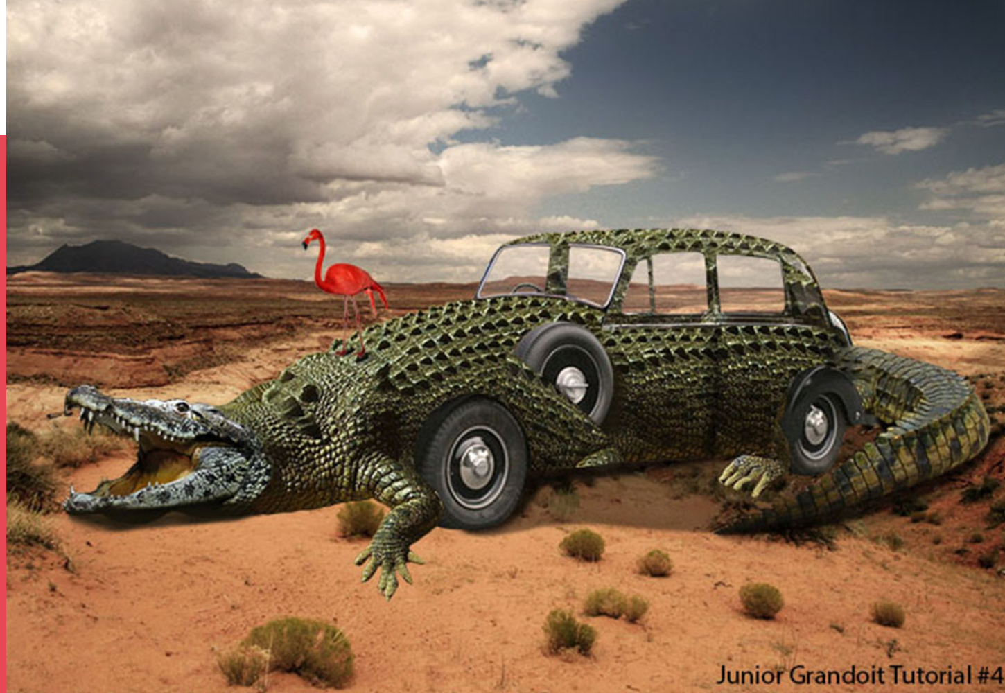
Photo effect tutorial to show photo manipulation! It was design in Photoshop